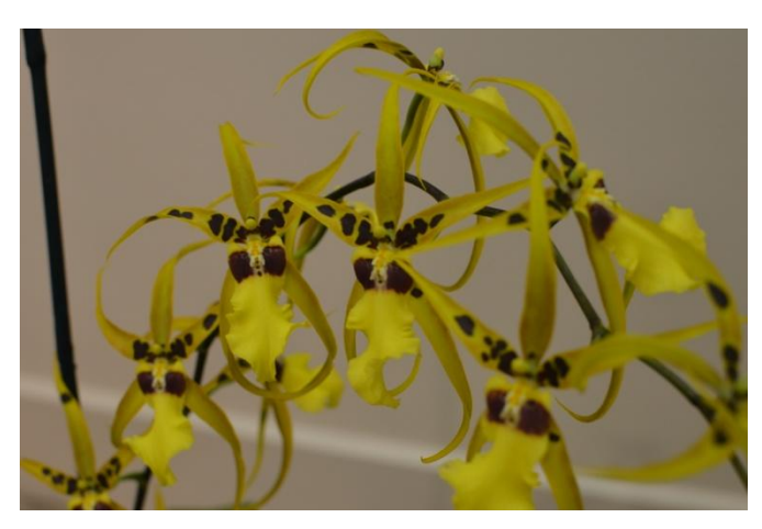
Aliceara Pacific Nova 'Pacific Heights'