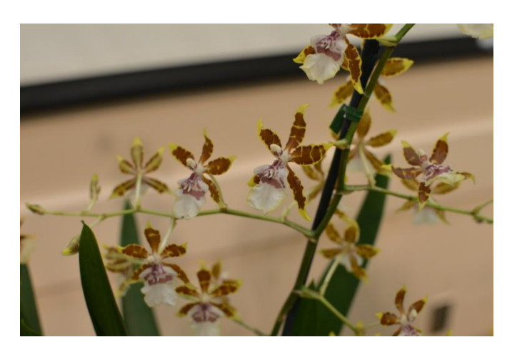
Oncidium Jungle Monarch Gloria Bygdnes