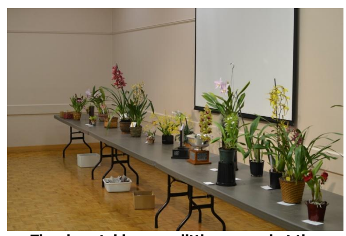
The show table was a little sparse, but the flowers were outstanding!