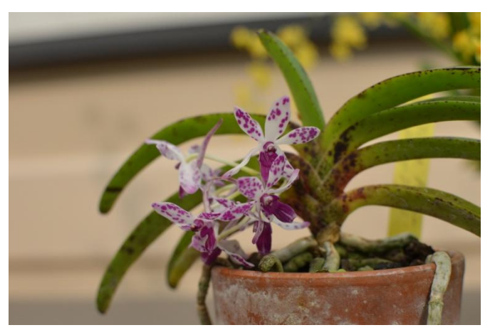
Neostylis Pinkie 'Starry Night' Chaunie Langland