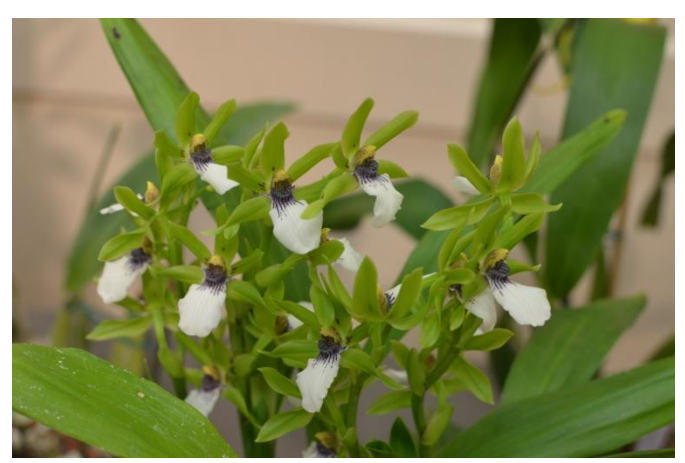
Zygoneria (Adelaide Meadows x Dynamite) Pierre Pujol