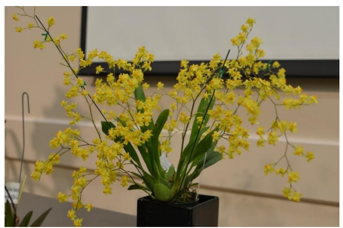
Oncidium Twinkle Chaunie Langland