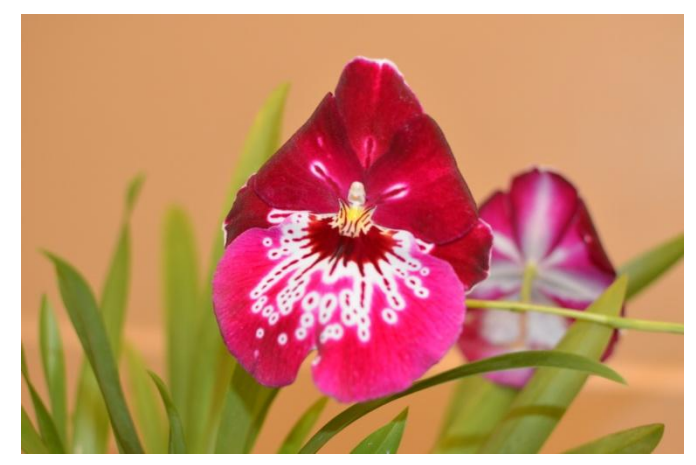
Miltoniopsis Gladys Fumiko Yokoyama