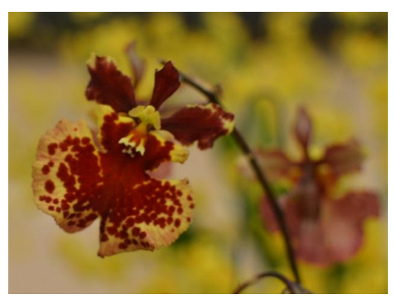
(Tolumnia Elfin Gem 'Kultana' x Oncidium Golden Sunset 'Waiomao') Chaunie Langland