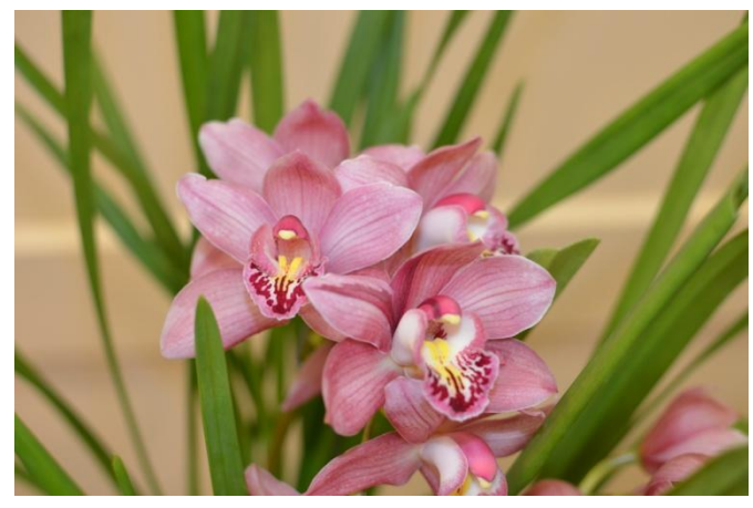
Unknown Cymbidium Janusz Warszawski