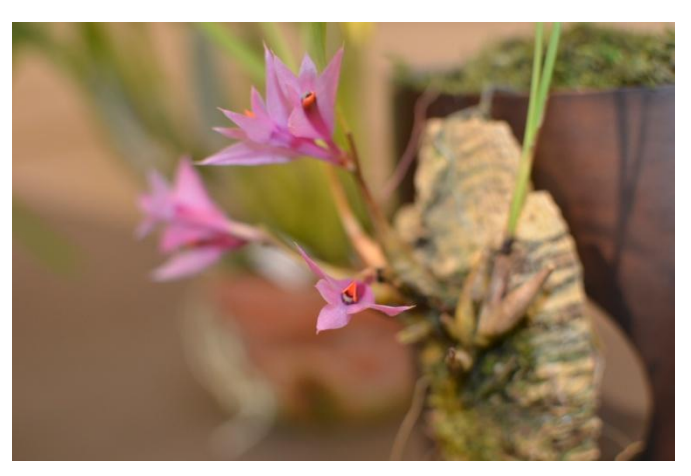
Dendrobium violaceum Ginette Sanchou