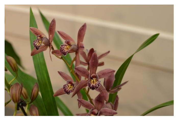
Unknown Cymbidium 'Mimi' Janusz Warszawski