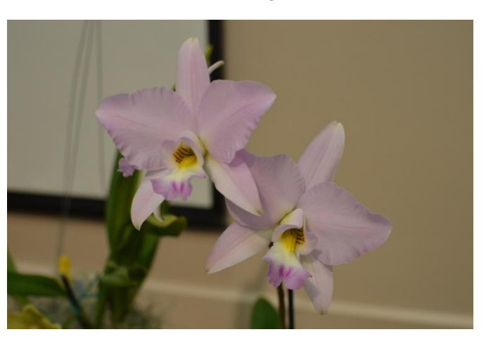
Laelia anceps 'Pink Beauty' HCC/AOS Pierre Pujol