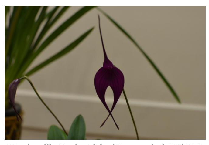
Masdevallia Machu Pichu 'Crownpoint' AM/AOS Jung Hee Ra