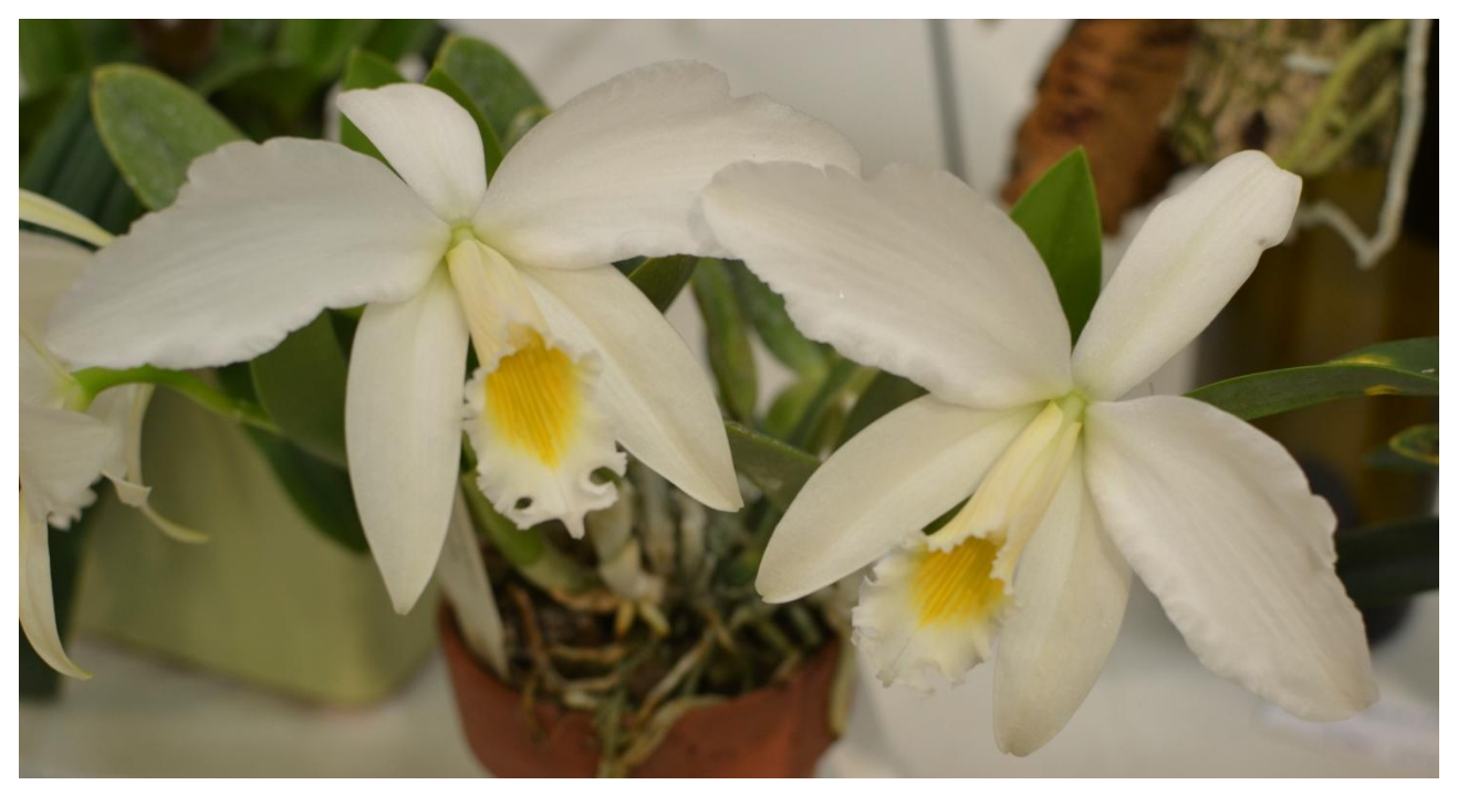
Cattleya jongheana var. alba Fred Shull