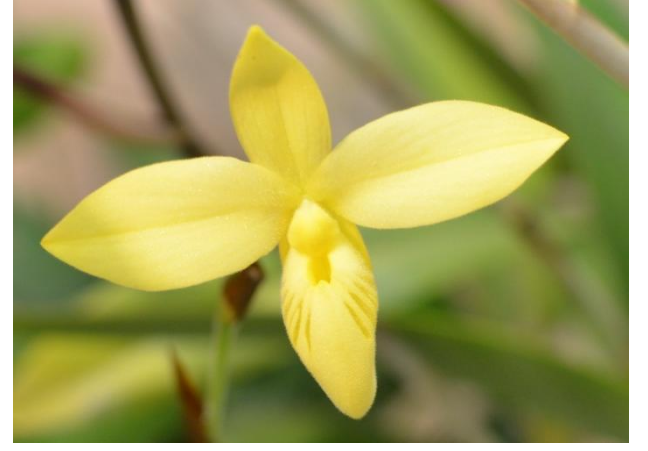
Phragmipedium besseae var. flavum ("Golden Heritage" x "Citron") Janusz Warszawski