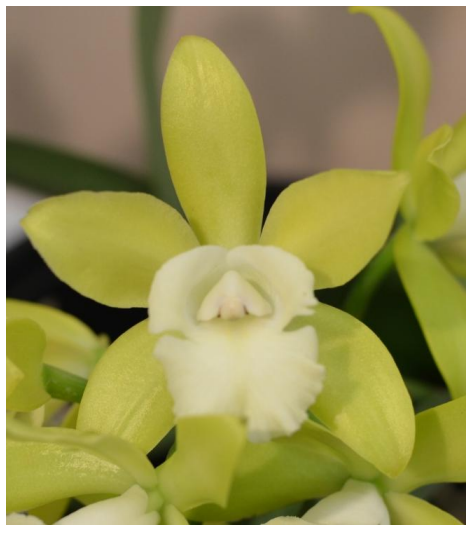
Cattleychea Siam Jade The Boomers