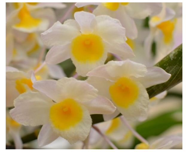
Dendrobium farmeri