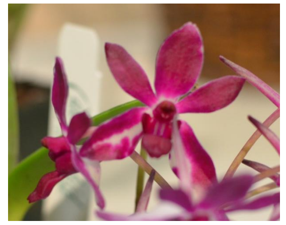
Vandachostylis Pinky "Dark Purple" The Boomers