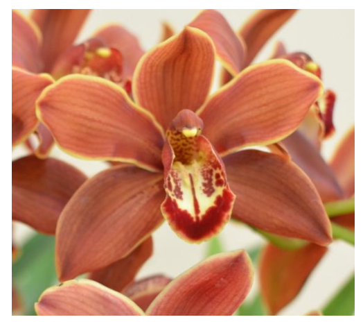
Cymbidium Procol Harum "Afterglow" Jeff Trimble