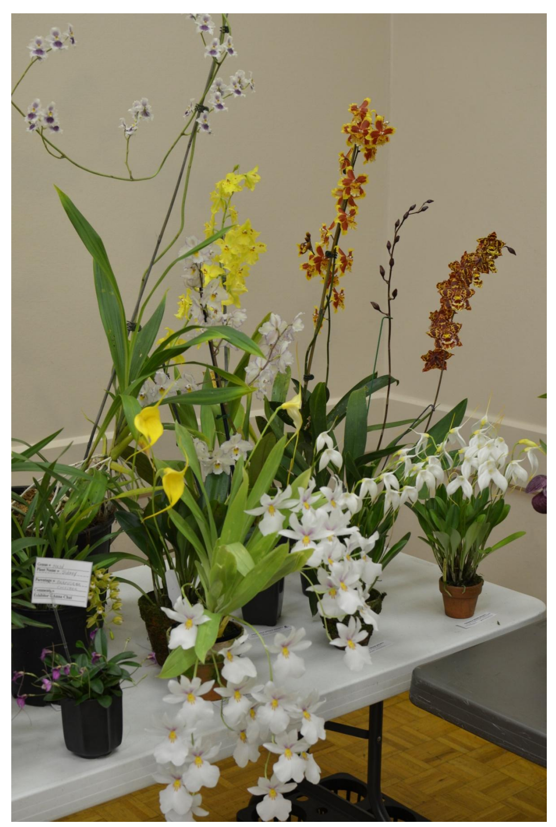
Odontoglossom alliance plants brought in by Neal Winslow