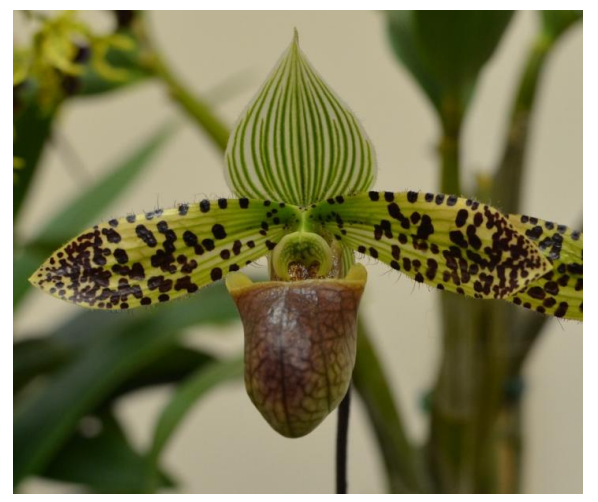
Paphiopedilum Double Deception "Wellz No Doubt" AM/AOS Pierre Pujol