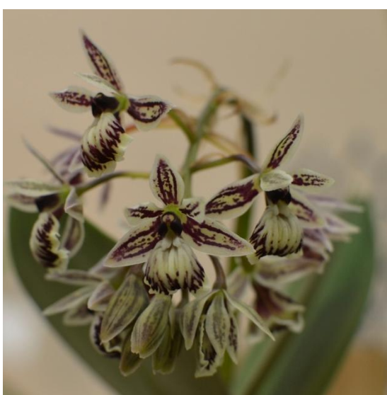
Epidendrum marmoratum