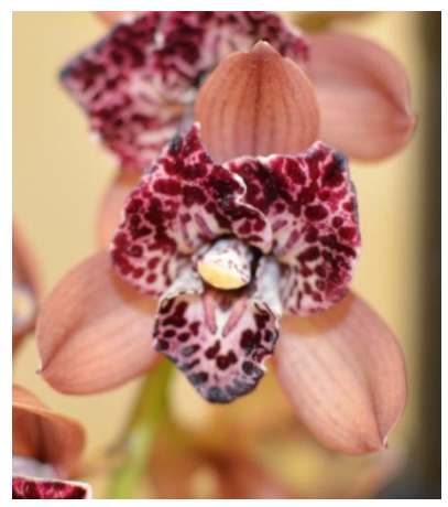
Cymbidium Hot Devon "Bird of Paradise" Pierre Pujol