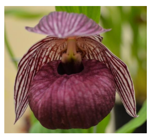
Cypripedium tibeticum Pierre Pujol