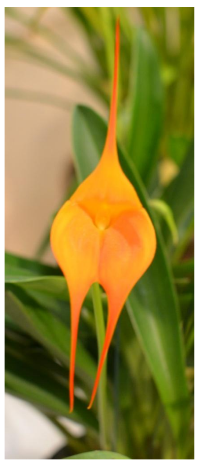
Masdevallia Fandango "AA" The Boomers