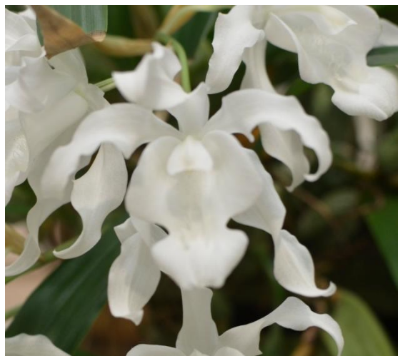
Coelogyne cristata var. hololeuca