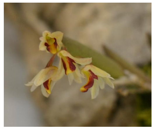
Dendrobium rigidum The Boomers