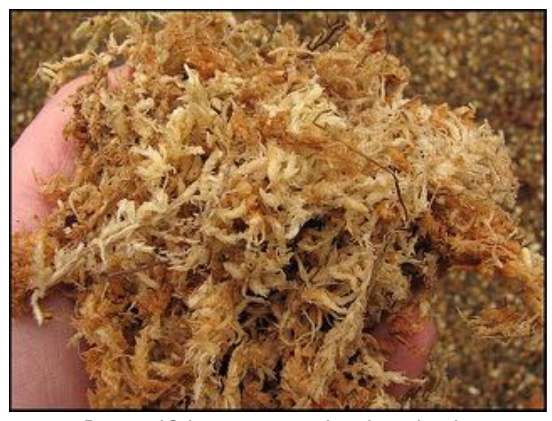
Dampened Sphagnum moss cut into shorter lengths When the 3 parts bark and 2 parts moss are mixed together to give the final potting mix, it looks like this: