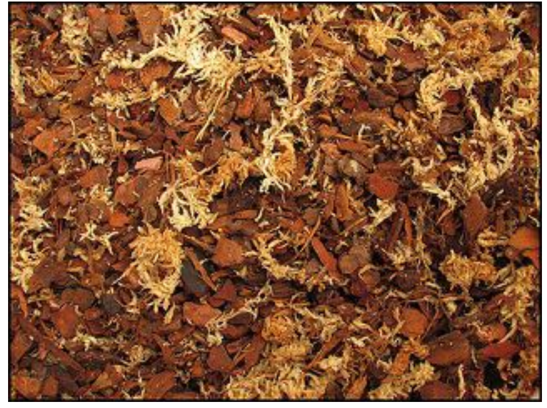
Pleione potting mix ready to use