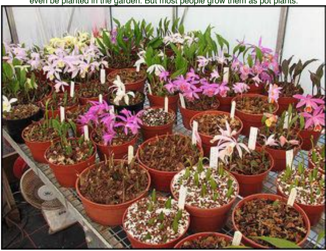
A Pleione collection grown in a glasshouse

Pleiones can be grown wherever conditions sufficiently mimic their natural habitat. They come from areas with distinct seasons of Spring, Summer, Autumn and Winter and grow best wherever the average summer temperatures dos not exceed 25 centigrade (though a few odd days up to 30 centigrade is tolerated). In winter, while they are dormant, they need to be kept cold but just frost-free. A range between 1 and 5 centigrade is ideal. If need be, small numbers can be kept in a fridge if your winters are usually too warm (you can un-pot them and keep them in the fridge in a paper bag). Within these restraints they may be grown on a windowsill, in a glasshouse or cold frame and may be put outside for those months that are frost-free. In areas with few and gentle frosts they can even be planted in the garden. But most people grow them as pot plants.