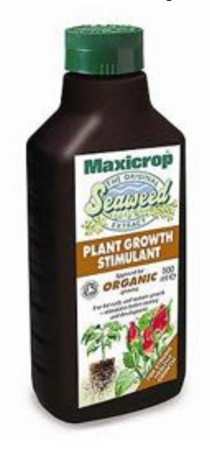
Maxicrop Seaweed Extract

This has an N - P - K analysis of 24 - 8 - 16 plus trace elements. I give this once a fortnight at about one third to one half of full strength. In the alternate weeks that they don't get this, I give them some liquid seaweed extract ("Maxicrop") again at one third to one half of full strength: