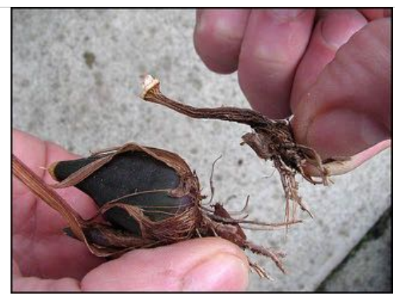
Old pseudobulb removed