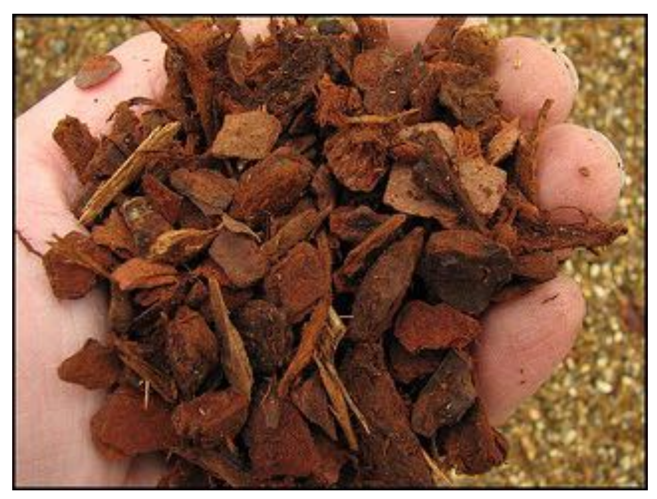
Melcourt potting bark

Pleiones will grow in a variety of compost mixes, the main requisites being that the mix should be very "open" and free draining. I have used various different mixes in the past, but now I always use a mix of 3 parts bark and 2 parts moss (All "parts" are by volume). The bark can be small to medium grade orchid bark or even a good quality mulching bark. Here in the U.K. I use a product called Melcourt Potting Bark, which is similar to (though not quite as good as) orchid bark in quality. This is what it looks like: