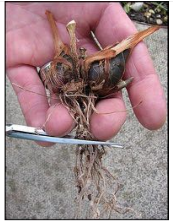
Trimming off old Pleione roots

pictures to show before and after trimming: