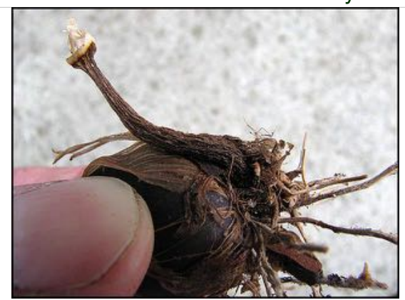
Old, shrivelled pseudobulb still attached to new pseudobulb

You will notice in the pictures above that there is an old, shriveled pseudobulb in between the two new pseudobulbs. Like the roots, the pseudobulbs are annual and towards the end of the growing season they shrivel and die. The old pseudobulbs should be removed and thrown away: