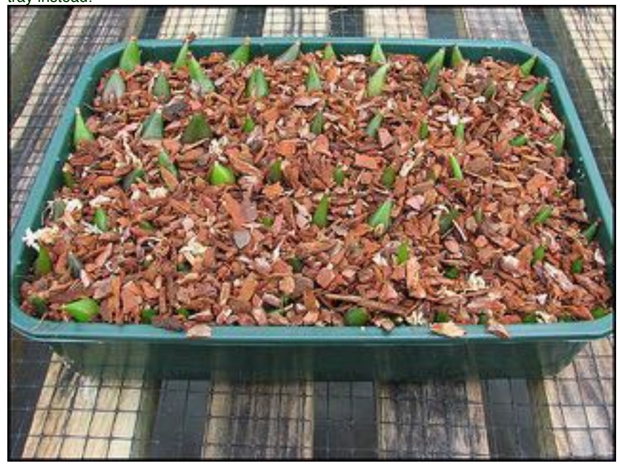
Planting in a seed tray

If you have a lot of one variety, whether adult size or smaller bulbils, you can use a seed tray instead: