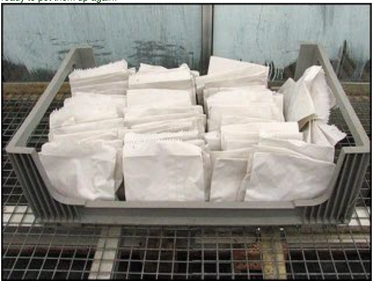
Pleiones stored in bags awaiting potting up

Once they have been un-potted, the old compost removed, roots trimmed and old pseudobulbs removed, I store the new pseudobulbs in paper bags in trays until I am ready to pot them up again: