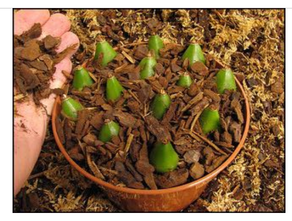
Adding bark topdressing

If you have a lot of one variety, whether adult size or smaller bulbils, you can use a seed tray instead: