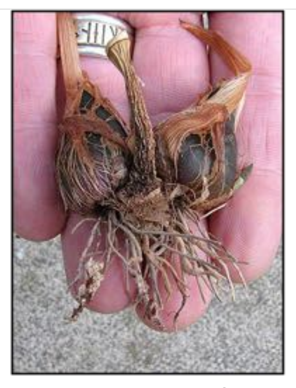
Pleione roots after trimmimg

You will notice in the pictures above that there is an old, shriveled pseudobulb in between the two new pseudobulbs. Like the roots, the pseudobulbs are annual and towards the end of the growing season they shrivel and die. The old pseudobulbs should be removed and thrown away: