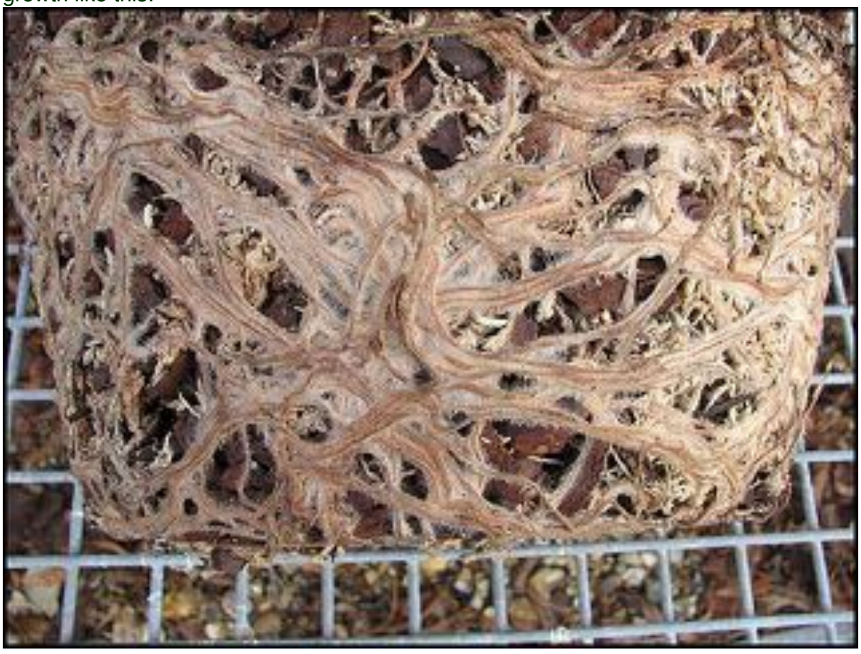
Old Pleione roots at re-potting time

When you remove them from the pot you hope to see that they made lots of good root growth like this: