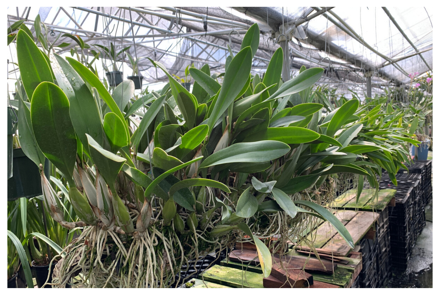
Top: A Laelia anceps log about 4 ½ years after the original mounting. The log itself is no longer visible, nor are the eye hooks where the hangers are attached. This three-foot-long log now weighs over 50 pounds when wet.