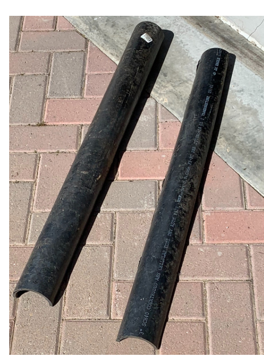
Left: Obviously, I only mount pieces of plants on the upper half of a tube. Because of this, I split the tube lengthwise into two pieces, which can then both be used as top halves of a tube. Either a table saw, or a reciprocating saw, can be used to split the tube lengthwise.

Middle: I want these logs to last a long, long time. Because oak cork can degrade over time, I provide support in back of the tube to support it for longer life. What I use is either three- or four-inch diameter ABS soil pipe, depending on the oak cork tube diameter. ABS soil pipe is heavy duty, easy to use, relatively inexpensive, and can be sawn and drilled with ease.