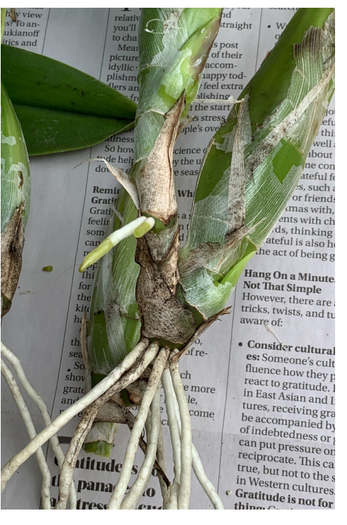
Top left: This is a Laelia anceps plant after repotting. There aren't enough pieces left in this plant for mounting on a log, but before it was repotted, there could have been.

Top right: This Laelia anceps was repotted two years ago, and is now badly overgrown. This plant is a great candidate for log culture, since it's vigorous, tends to send up at least two new growths from each of the prior year's growths, has shorter rhizomes, and is a prodigious rooter.