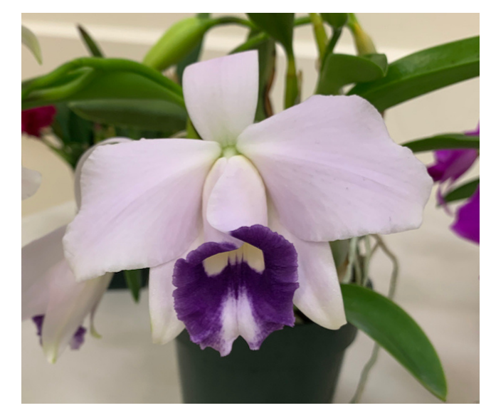
Laelia pumila var. coerulea