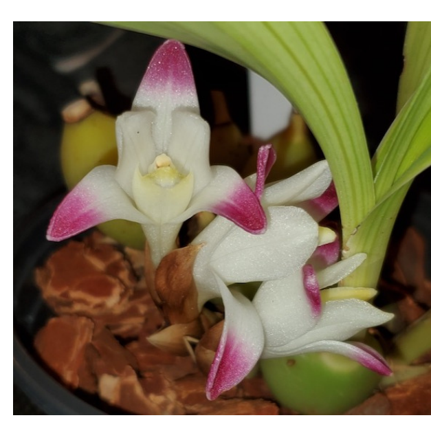
Coeila bella, Audrey Young-Tarter