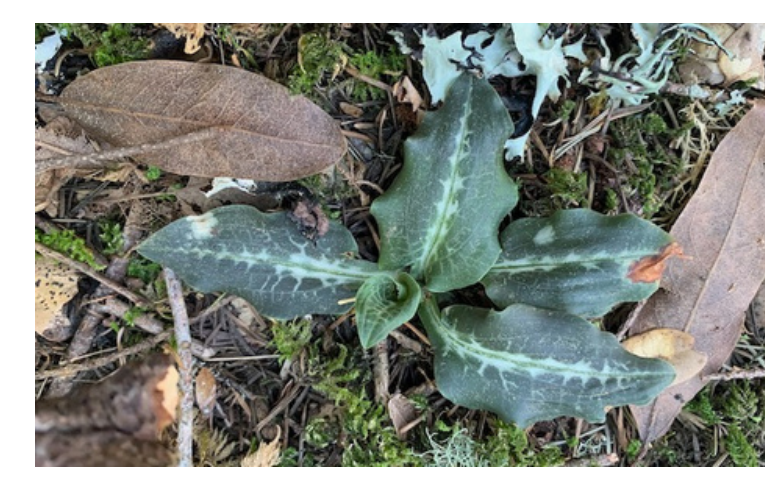
Calypso bulbosa var. occidentalis (top two images) and Goodyera oblongifolia (bottom).