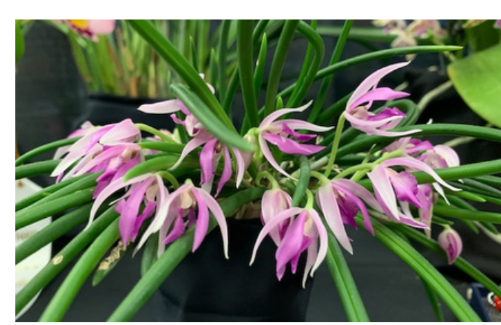
A few orchids shown at the Pacific Orchid Expo last month! Clockwise from top left: Lycaste Chita Dream x Shoalhaven, Leptotes bicolor, Sophrolaeliocattleya Dorothy Elliot x Laelia anceps, Leptotes pohlitinocoi, Bonatea speciosa 'Green Egret' AM/AOS.