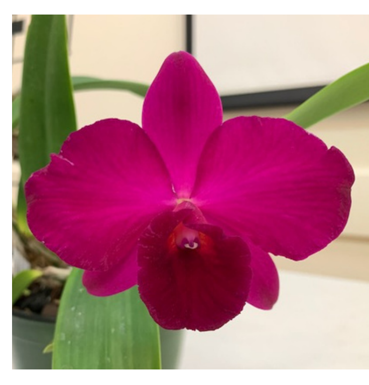
Rhyncholaeliocattleya Rubescent Doll, Chaunie Langland