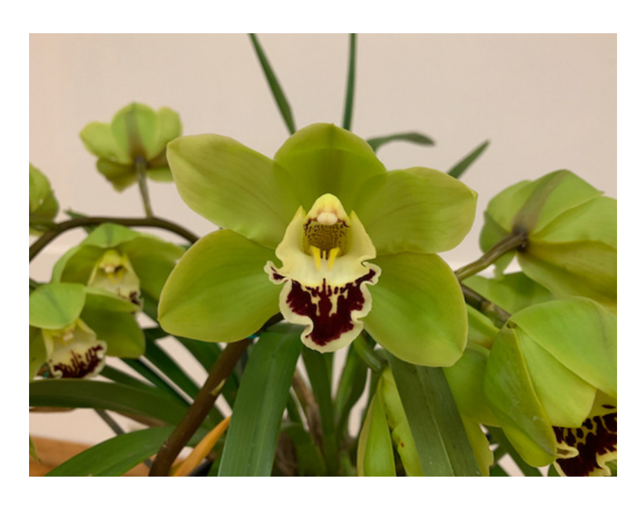
Top: Cymbidium Green Sour 'Fresh' (Mariko Nagashima) Bottom: Cymbidium Eaglewood 'Kana', AM/AOS (Chaunie Langland)