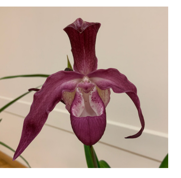
Top to bottom: Paphiopedilum philippinense var. laevigatum (Chaunie Langland), Brassocattleya Gulfshore's Beauty (Tom Waugh), and Pragmipedium Incan Treasure (Chaunie Langland).