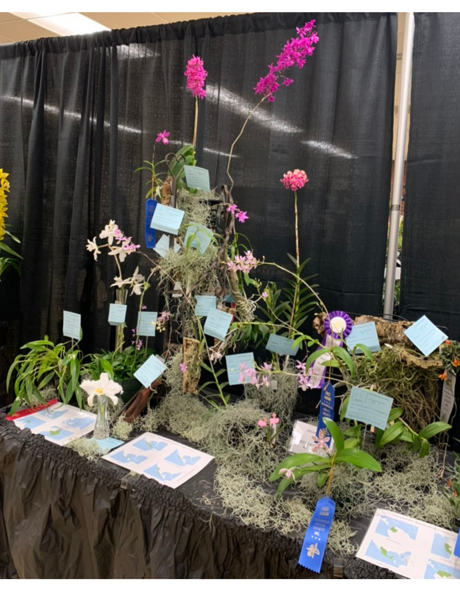
Other part of the display table from Chaunie Langland