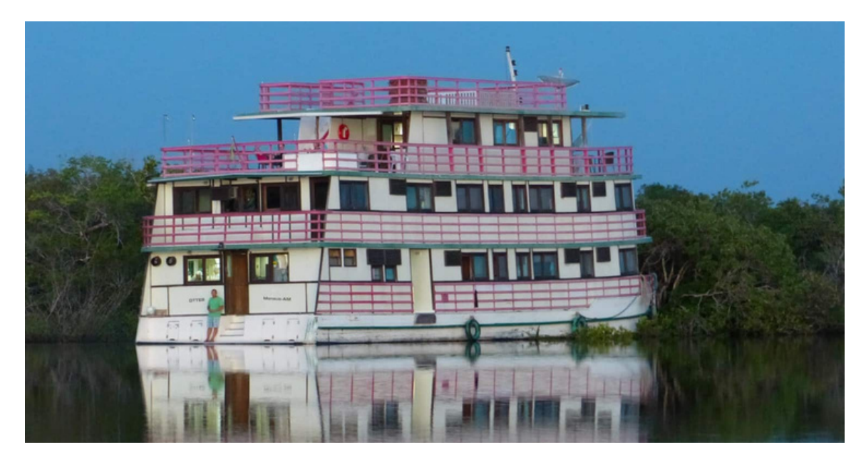
The Otter, our riverboat accommodation for the tour