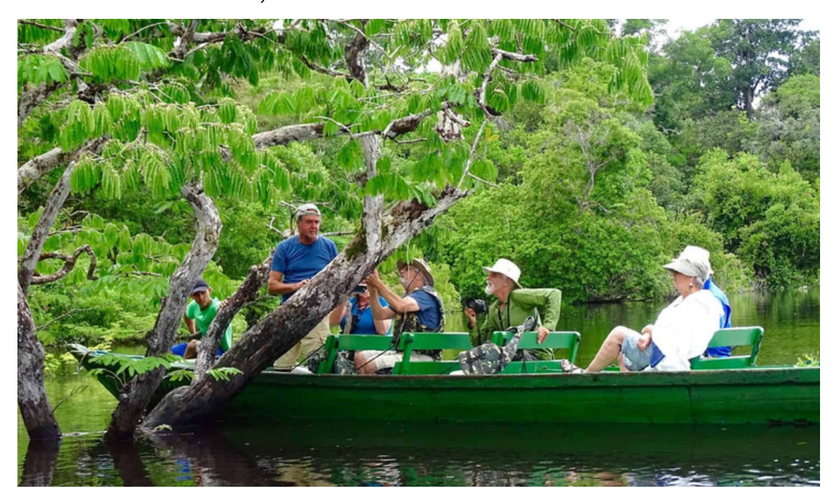
Floating up to the orchids on the Rio Negro