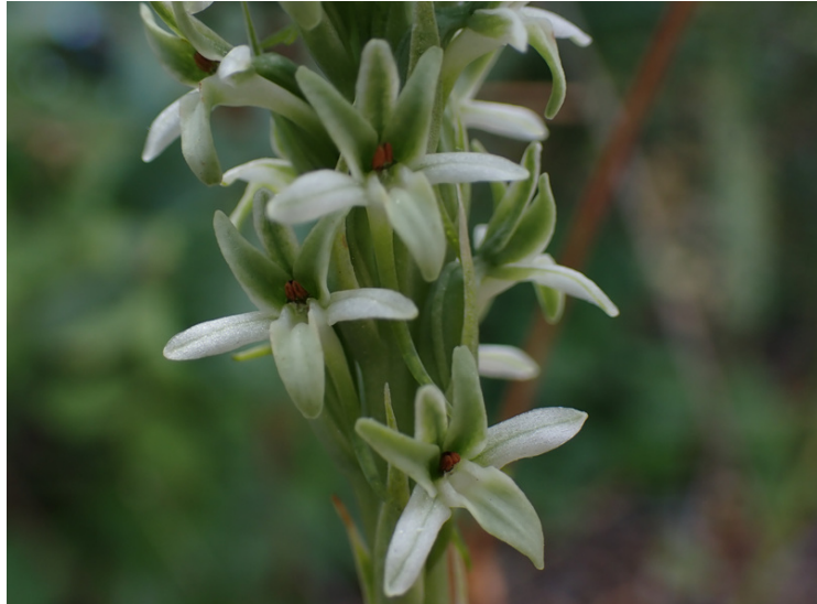
Platanthera elegans ssp. elegans